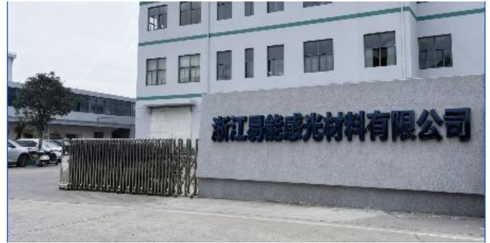
(2) Mid China Factory (24,000m 2 )

Address: Economic and Tech development zone, Nanyang, Henan province, China P.R